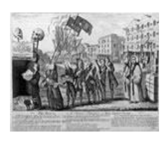
Declaration of Independence